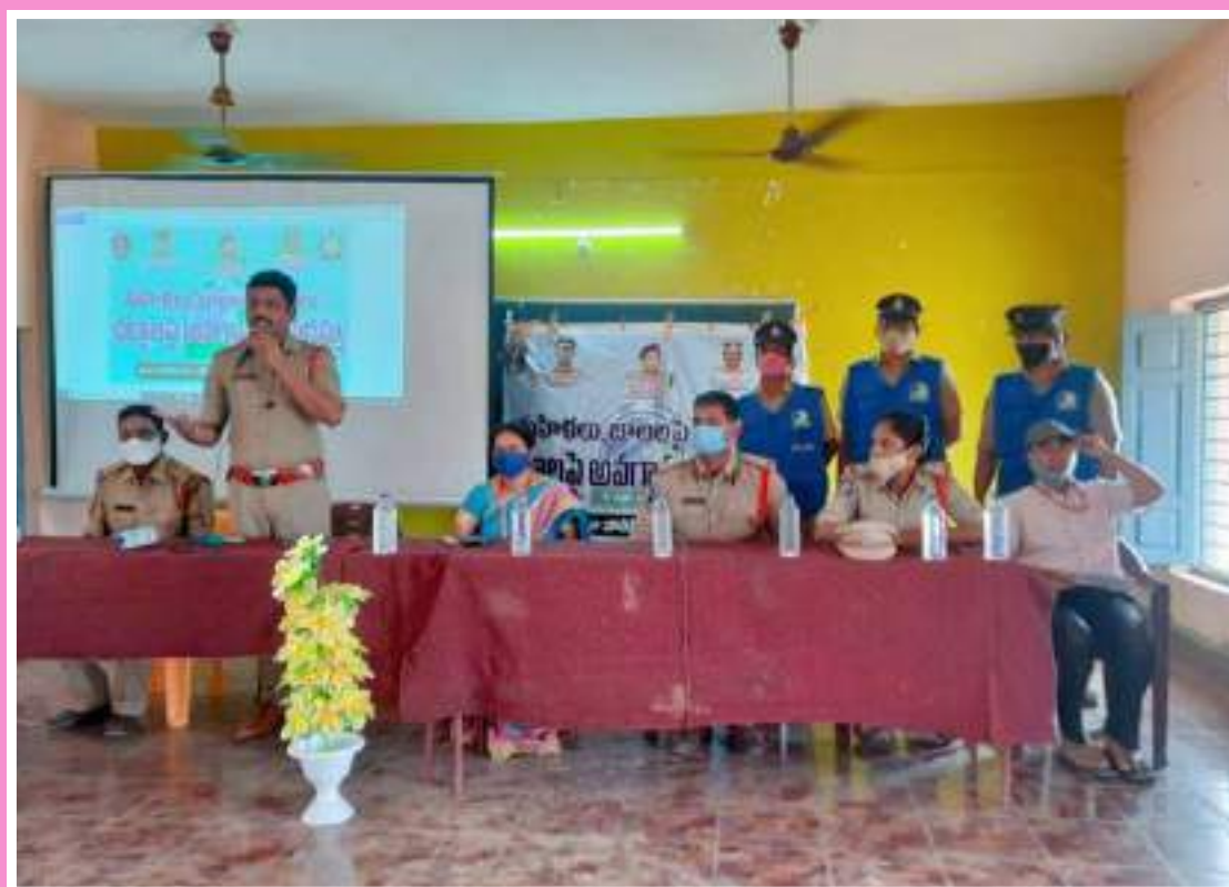
Resource Person : Officers from the Police Department